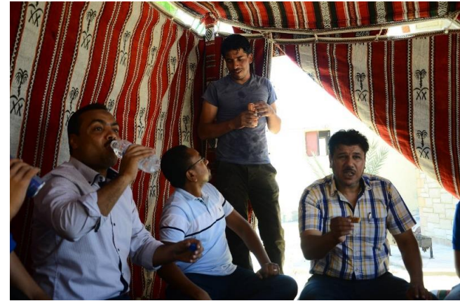
Meeting Bedouins of North-Central Egypt

in the design of four mobile apps for ICH self-documentation.