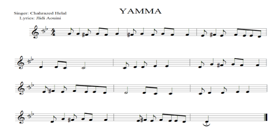
Figure 3: the inherited and updated partition of Yamma Song

Mrs Helal was right to think so, as an inherited discovered song, facing the risk of extinction and just vocally transmitted from mum to son, should be saved, "just like it is done with a discovered archaeological site: being a cultural gain for the homeland, it deserves a hard work of a traces' research team" (Misk, 2017) as she said.